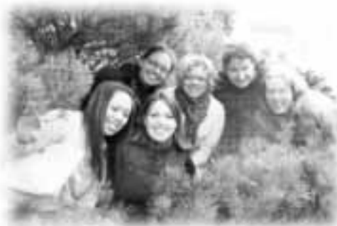
▲ Some CCO Saskatoon students and staff.