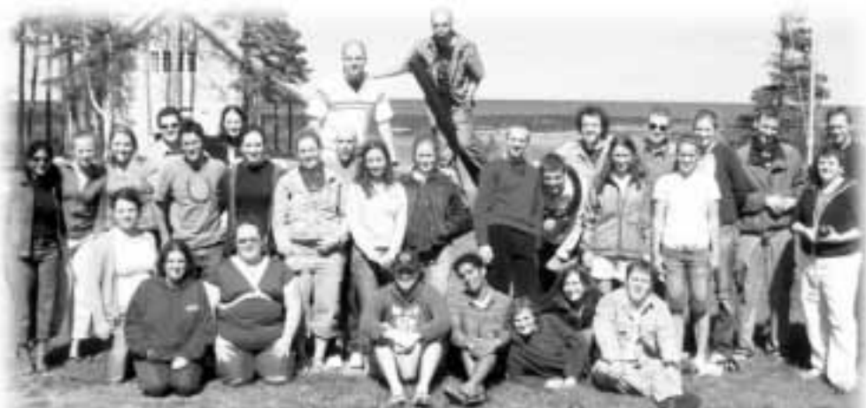
CCO Halifax at their first annual Fall Retreat.

God is moving powerfully in Halifax and CCO is blessed to play a part in it!