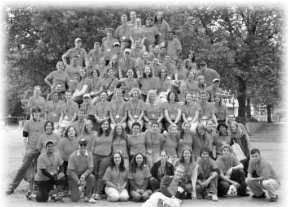
▲ CCO's World Youth Day group in Cologne, Germany.

paintings, the altar, but I knew that it was not these things that had made her a Saint. As I prayed that Jesus would help me know Gianna, I tried to put myself in her place, not only physically, but spiritually. Jesus then showed me what it was He wanted me to learn. Before leaving for our pilgrimage, I was discerning my vocation to religious life. I had been discerning for quite some time, but for most of that time, I refused to accept such a vocation because I felt it was too hard for me to give up my dreams of being a wife, mother and doctor. Jesus showed me that, although Gianna experienced those three vocations, she, like myself, was called to offer them back to Jesus. Gianna knew the joy that came from being a wife, a mother, and a doctor, but she knew that there was a greater joy in following the Lord's will and in loving it. That is how she gave her life for the sake of her child's; she gave everything to Jesus without hesitation. I do not know what it