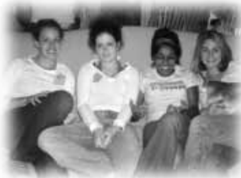
Girl's Night in Ottawa! ▶

CCO Ottawa has had an explosive first semester. After the summer mission trip staff and students met with over 100 students after a very successful popcorn survey. From these meetings over 30 faith studies have formed and have met each week on campus. Several of these studies are in the Faculty of Catholic Education, where CCO is helping to form future teachers. Our events have been gaining great momentum: in prayer, as more than 50 students came to our Summit Eucharistic Adoration to pray for our country; and socials, as more than 60 people participated in our Progressive Supper event. We thank God and look forward to even more growth next semester.