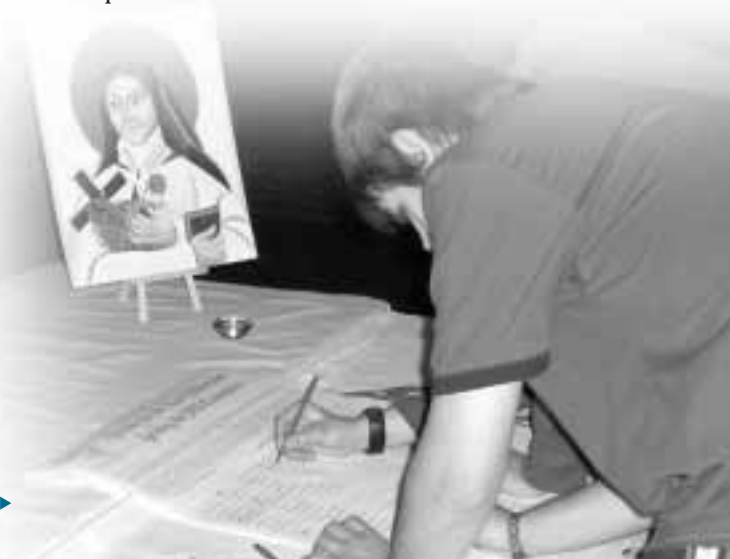
Students signing letter to John Paul II. ►

CCO must continue to be Jesus and to share Jesus with the countless university students searching for meaning in their lives. We have a great responsibility, by the power of God's grace, to live up to John Paul II's appeal to CCO. This is how CCO has and will continue to change the world. As the Holy Father said at World Youth Day 2000, "If you are who should be, you will set the world ablaze!" ♦