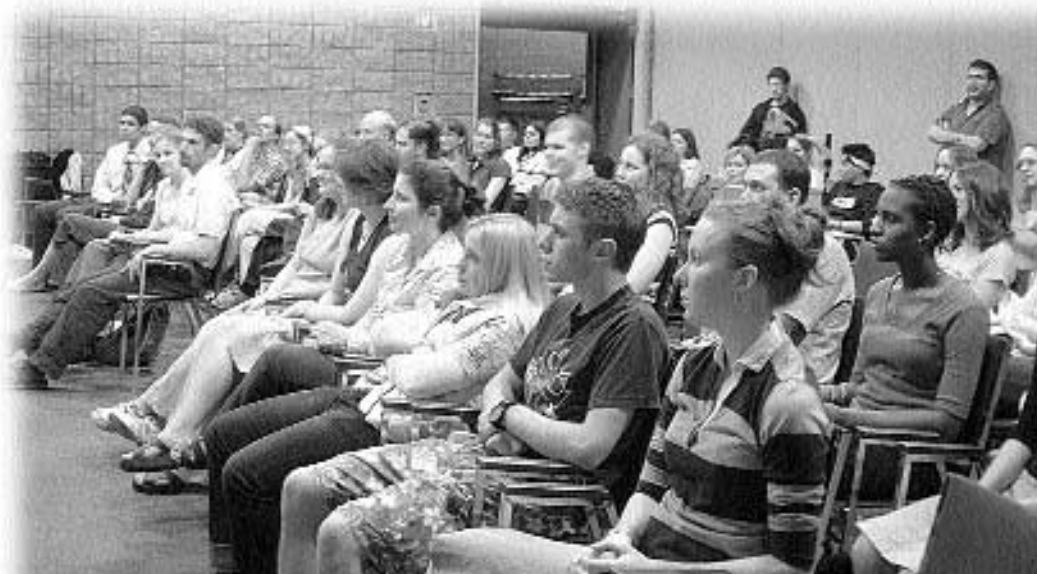
Students at CCO Ottawa ▶ summer “Top Ten” Event

One of our most successful events in Saskatoon this year was “The Great