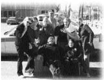
◀ CCO Saskatoon students at The Great Couch Relay with two local police officers

Couch Relay". Consisting of 6-8 people and a couch, teams were given a list of landmarks throughout the city and required to take a picture of the couch at that location to gain points. The team with the most points and creativity won. It was a successful event with an amazing turnout, largely due to the students' commitment to praying, promoting and inviting. One whole team was made up of completely new people who'd seen our event poster on campus and decided to register. They really enjoyed themselves, and we hope they will be involved in a Faith Study in the fall semester.